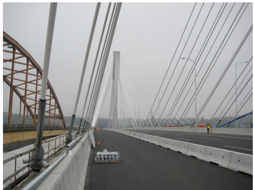
Figure 4: Port Mann Bridge